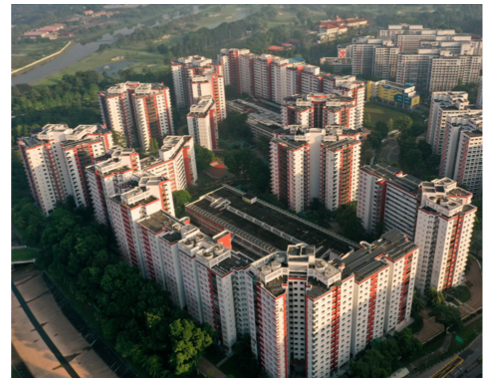
The SolarNova 2 and 3 projects in Singapore which are part of the SolarNova Programme by HDB