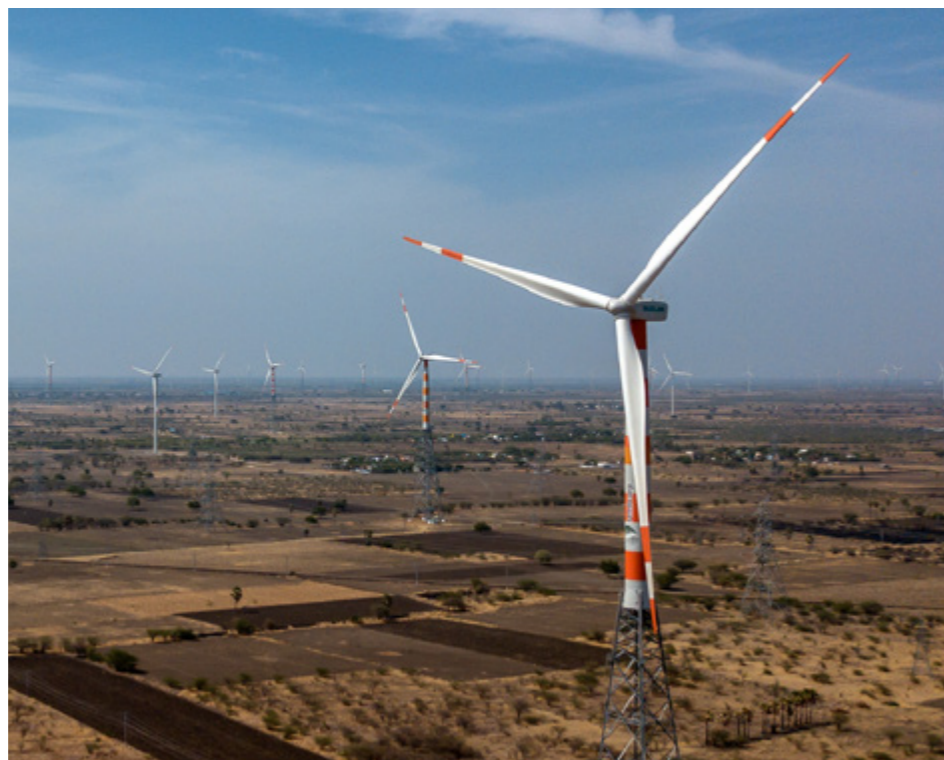
The 250MW SECI 1 project in Tamil Nadu, India