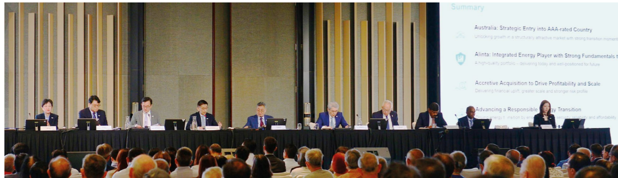
Sembcorp's 2026 Extraordinary General Meeting convened for shareholders' approval of the proposed acquisition of Alinta Energy

Sembcorp is committed to ensuring the investment community receives accurate and timely updates to support informed decision-making.